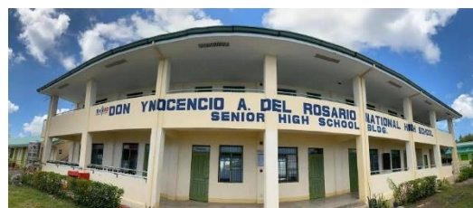
Don Ynocencio A. Del Rosario National High School